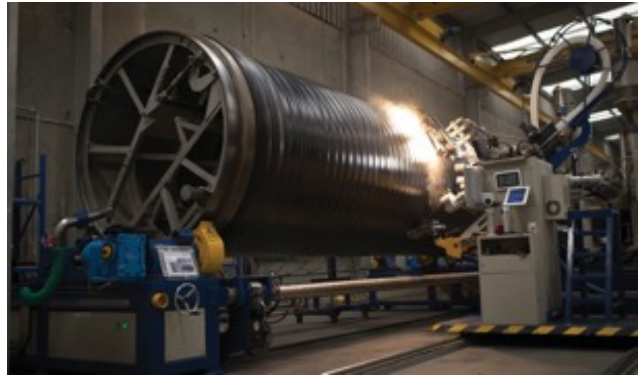
FIG. 1 Supaduct® Rural manufacturing process.